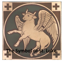
The seal of St. Luke

For nothing will be impossible with God. Luke 1: 37